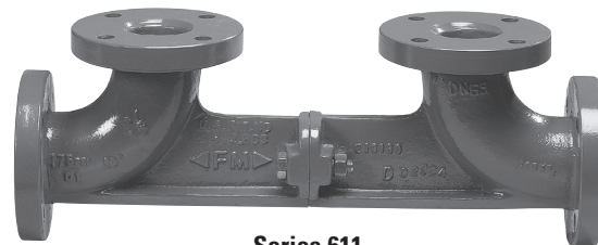
Series 611 U.S. Patent No. 5,392,803

The FEBCO Series 611 Flange by Flange Valve Setter is constructed of fusion epoxy coated ductile iron. Valve setters are designed to augment the installation of the "N" series backflow prevention valves. Integral ductile iron support between elbow transfers thrust downstream, thus eliminating thrust block requirements between elbows.