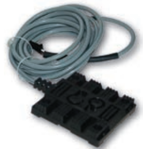
Water Detector Pad