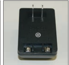
Power Supply - connections