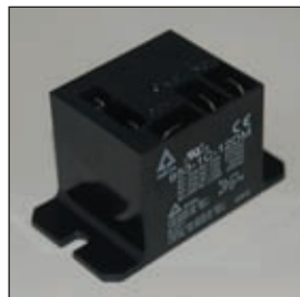
Oil Fired or Spark Ignition

The Power Cutout Module is specific to the WDS model; electric, oil fired/spark ignition, or standing pilot. Standing pilot units are used to interrupt the thermocouple, and they are available in right-hand threaded and left-hand threaded models.