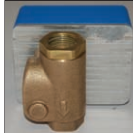
Control Unit - back