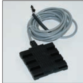
Water Detector Pad

The Water Detector Pad lays flat on the floor or in a water heater drip pan. The pad employs state-of-the-art sensing technology. There are no terminals to rust or corrode assuring years of maintenance free operation.