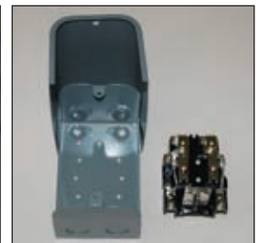
Electric - 220VAC