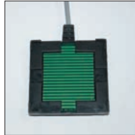
Water Detector Pad - bottom