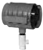
Drain or Vent Port