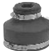
Flexible Terminating Coupling