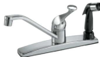
B540 - Single lever kitchen sink fitting, 3 holes, 8" (203 mm) centers mounting, metal lever handle, 8" (203 mm) swing spout, 2.0 gpm (7.6 L/m) aerator with side spray through the deck plate