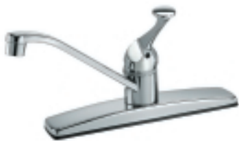
B548 - Single lever kitchen sink fitting, 3 holes, 8" (203 mm) centers mounting, metal lever handle, 8" (203 mm) swing spout, 2.0 gpm (7.6 L/m) aerator