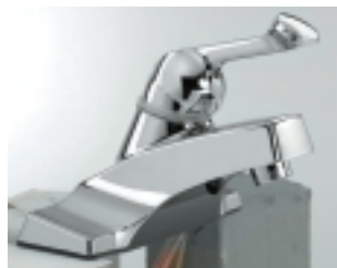
B144 - Single lever lavatory fitting, 2 hole 4" (102 mm) centers mounting, metal lever handle, 2.0 gpm (7.6 L/min) aerator