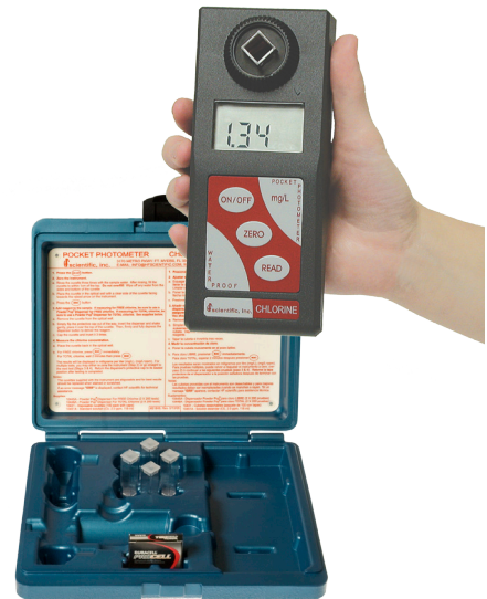
Pocket Photometer with Case