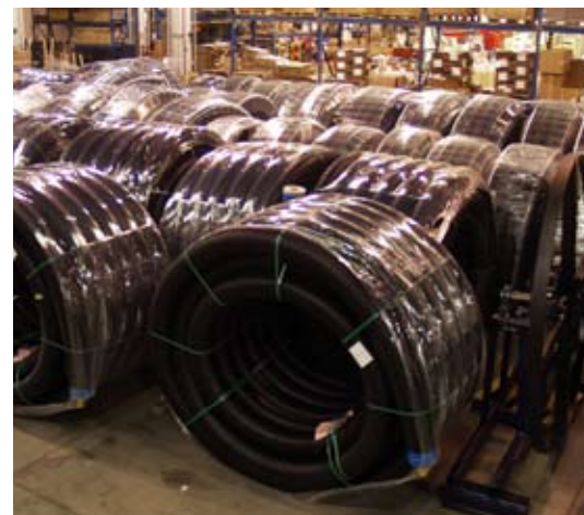
R-flex coils ready to be shipped.

If there is a need to transfer heated water, or water/glycol, from one location to another, then there is a need for R-flex.