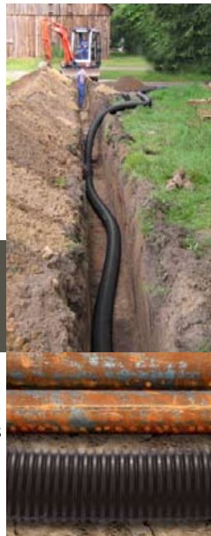
Rust-free is worry-free.

80 psi (5.52 bar) 100 psi (6.89 bar) 160 psi (11.03 bar)